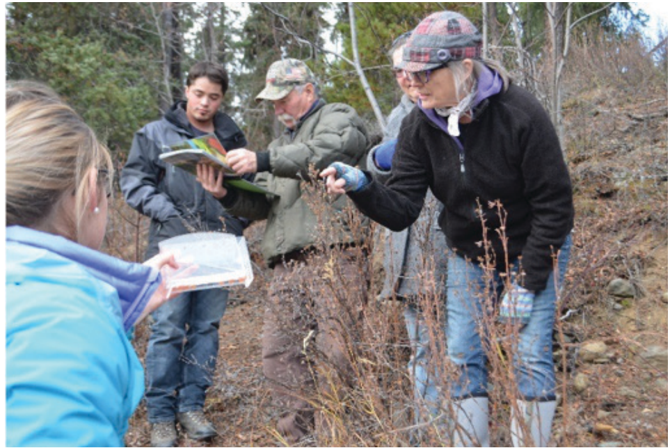
Above: Community members and TRRC members visiting Morley River to learn about the Deadman Creek restoration project. Below: Photo caption: Chinook alevin (newly hatched salmon) being counted and measured to assess project success.

Our department has completed an internal review, and an Advisory Group (AG) consisting of representatives from Executive Council, Elders Council, Youth Council, and the Teslin Tlingit Renewable Resources