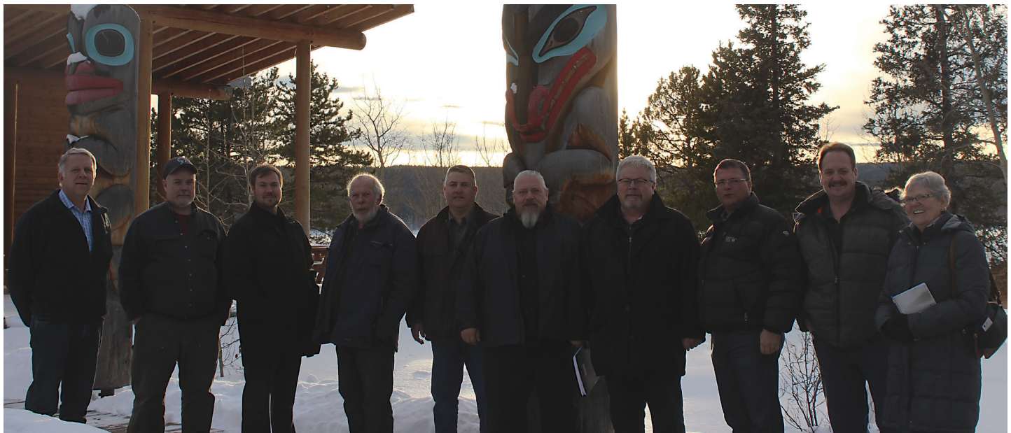
Above: December 1, 2017 – Representatives from Yukon Development Corp (YDC) travelled to Teslin to tour the Biomass Project. The Biomass has been a long-time vision for residents of the community. To see the buildings up, boilers installed, wood being chipped, Teslin has almost completed phase 1 of the project. TTC and DDC presented a very new video called “Teslin’s Biomass Project”.