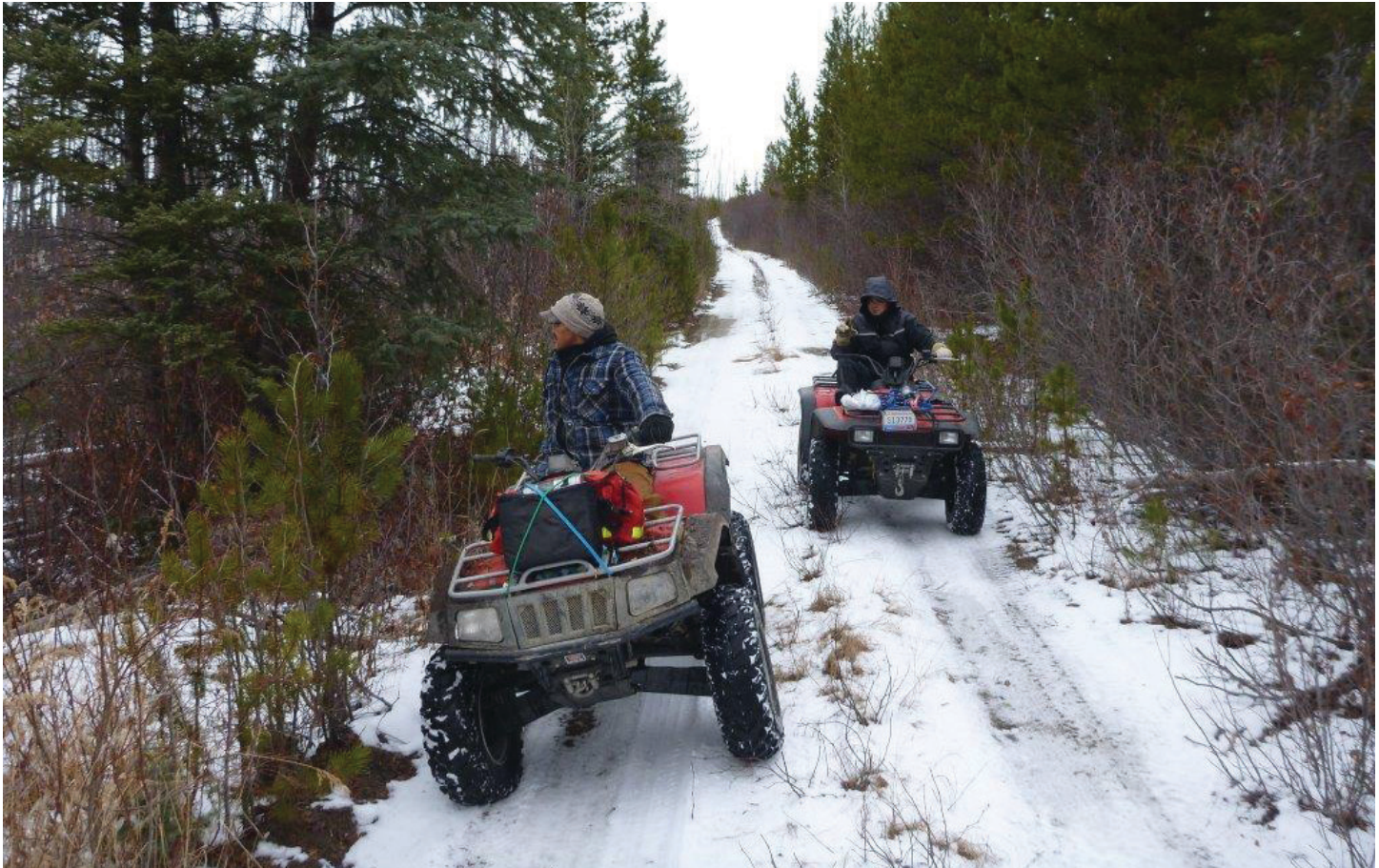
Above: Game Guardians ground truthing potential fuelwood areas for Biomass at Smart River

on December 5th (watch for posters) or come in and talk to the Lands Department, the RRC or the Yukon Forest Management Branch.