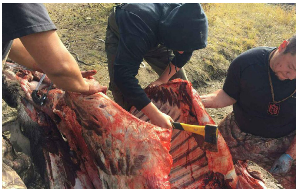
2018 harvest season: Congrats to these three young gentleman on their first moose harvest! Very proud of you all!