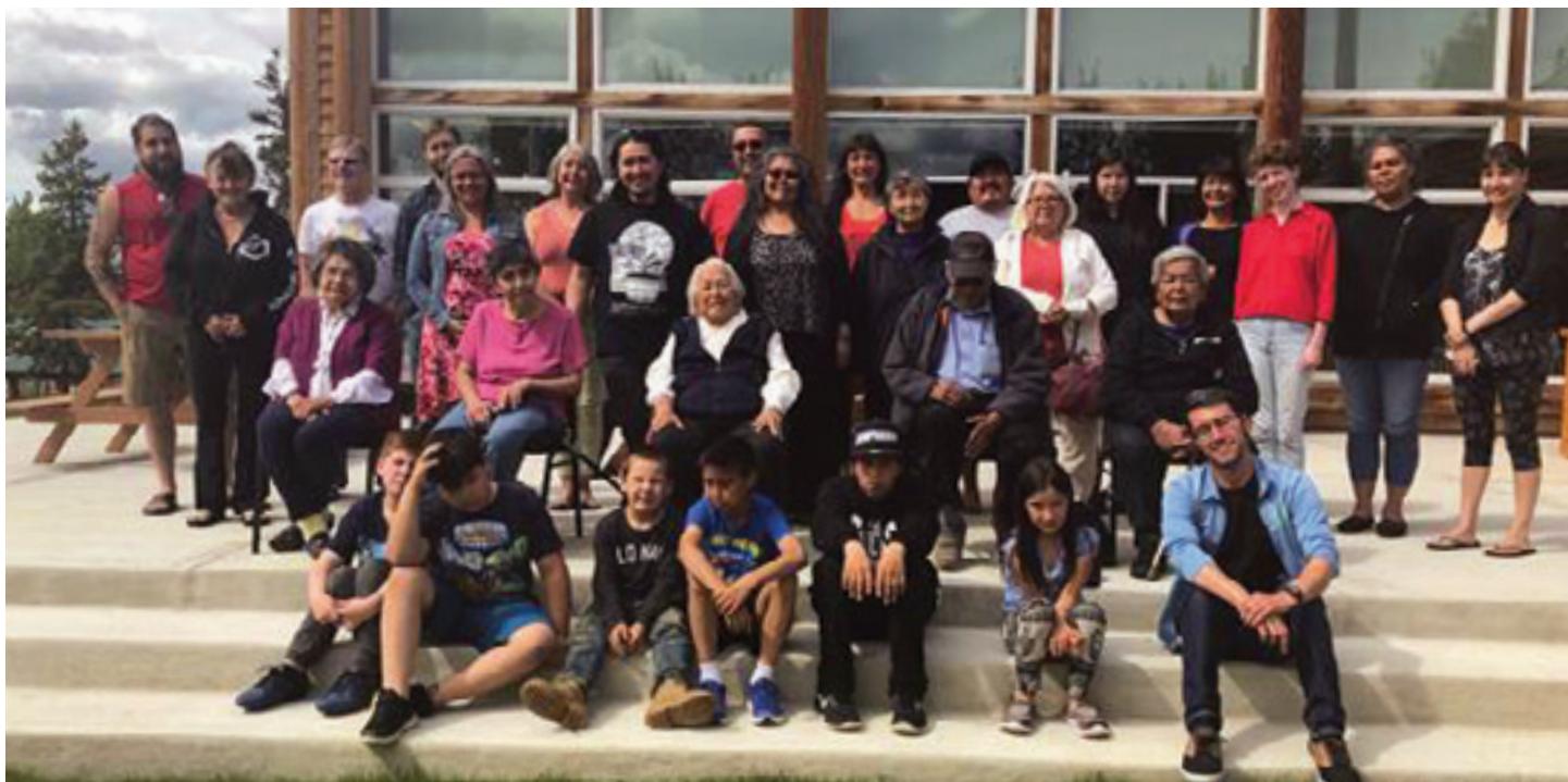
Above: Dakká Lingit Sh Tóo Dultóowu June 11-29, 2018. Outside the Heritage Centre, first week of class!