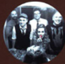
MUSSELL AND THE FLEX