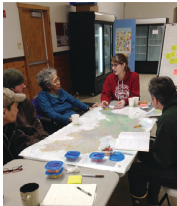
Above: Salmon Management Plan Advisory Group and Lands department meetings to review the 2010 plan and begin structuring the revised plan.