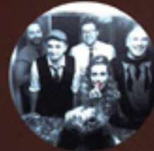
MUSSELL AND THE FLEX