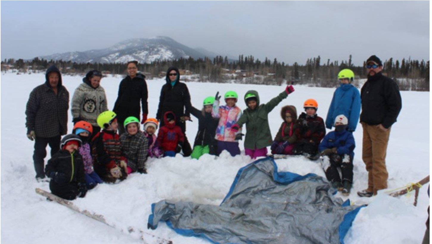
PHOTO: Youth have an exciting time watching the fishnet being pulled.