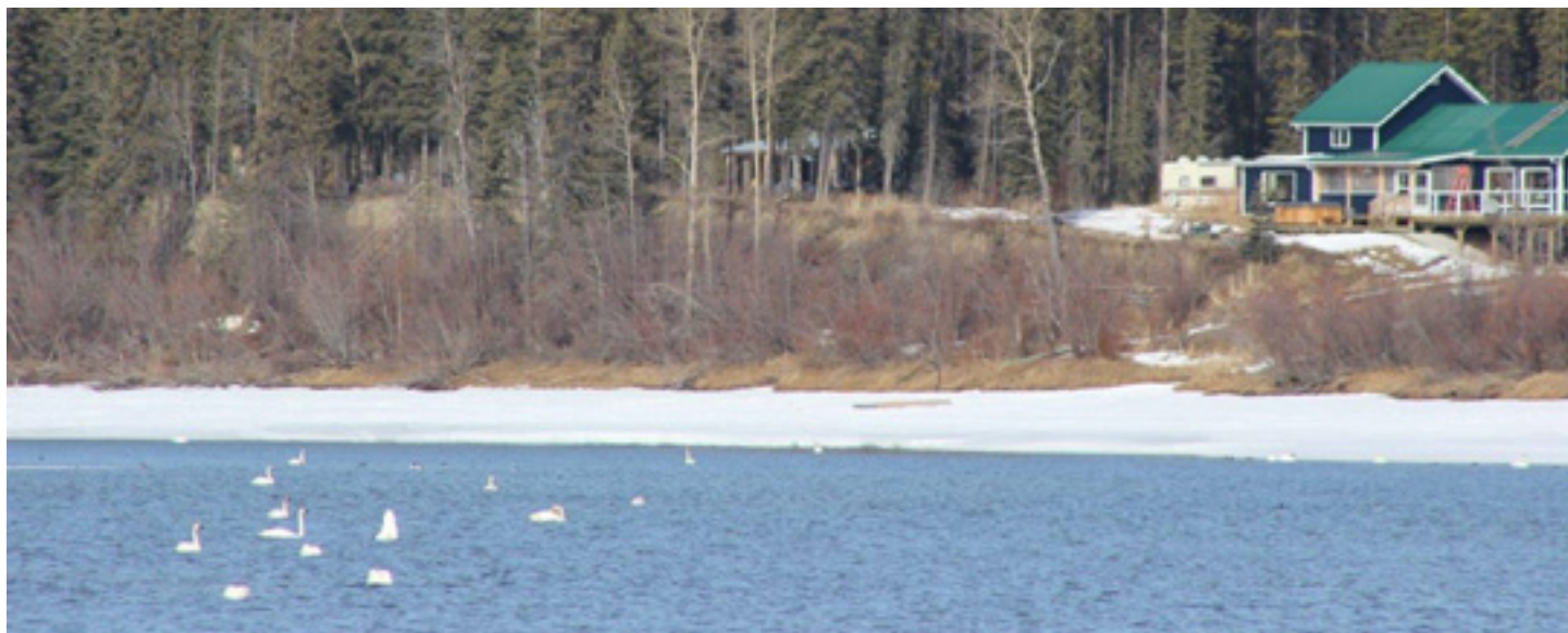
Photo: Swans on the Teslin River