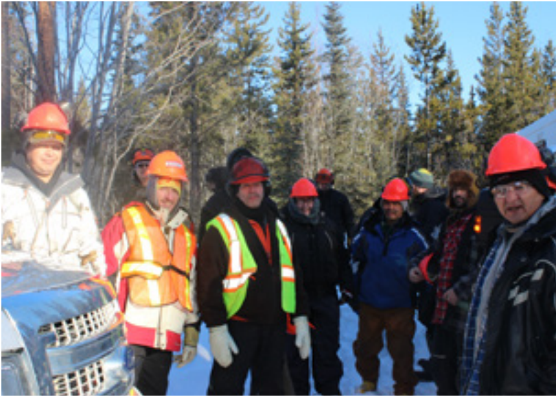
ABOVE LEFT: Biomass Training took place in March – there was plenty of participants. ABOVE RIGHT: Biomass burner.