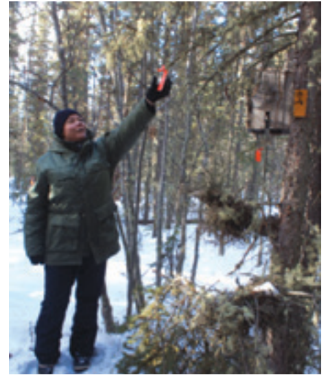
Photos: Participants during the Trapper Training Course hosted by TTC and TRRC