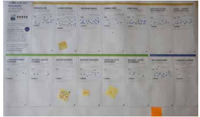
Each participant was given four dots for each project owner. The dots were placed under projects that they thought were of highest priority.