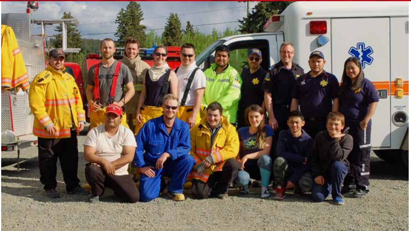
Joint Training held on May 30th with Teslin Fire Department, Teslin EMS and Teslin RCMP