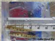
Lake trout fry

If you catch a tagged lake trout, please keep or release the fish as if it were not tagged and record the date, location, tag color and number and whether the fish was kept or released. You can report the tag to one of the following: