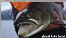
Adult lake trout