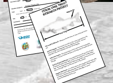
BC Border Area tag