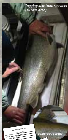
Tagging lake trout spawner (10 Mile Area)

To pick-up sampling supplies, call one of the phone numbers above or pick them up from the Nisutlin Trading Post or at the sample boxes located at the boat launch in Teslin or the 10 Mile Boat Launch. Increasing the number of samples from harvested lake trout is extremely important for this project to proceed. Everyone who provides samples or reports tags will be entered in a draw for prizes in November 2017 (last year's prizes included a generator, chainsaw, etc).