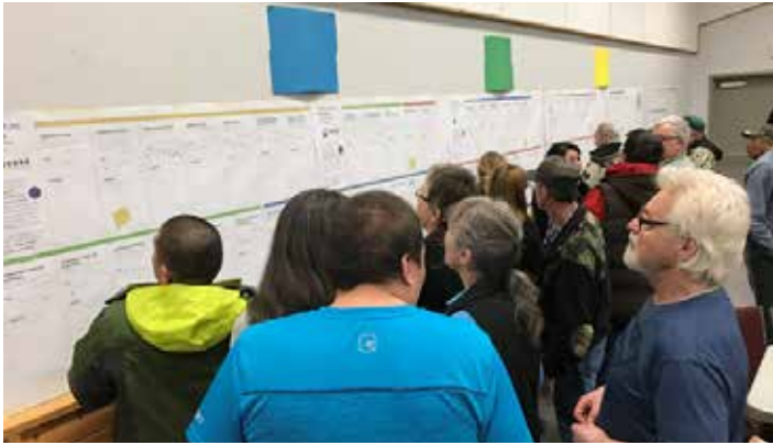
The community members participating in the Dotmocracy Priority Ranking Exercise. There was large sheet with each project on it for each project owner (VoT, TTC, and Joint VoT and TTC). Participants prioritized their top four projects under each project owner.