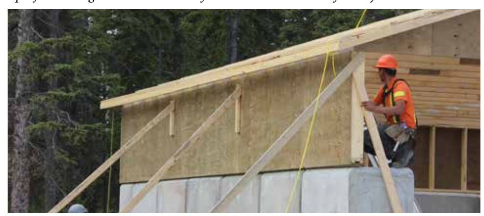
What are the benefits?