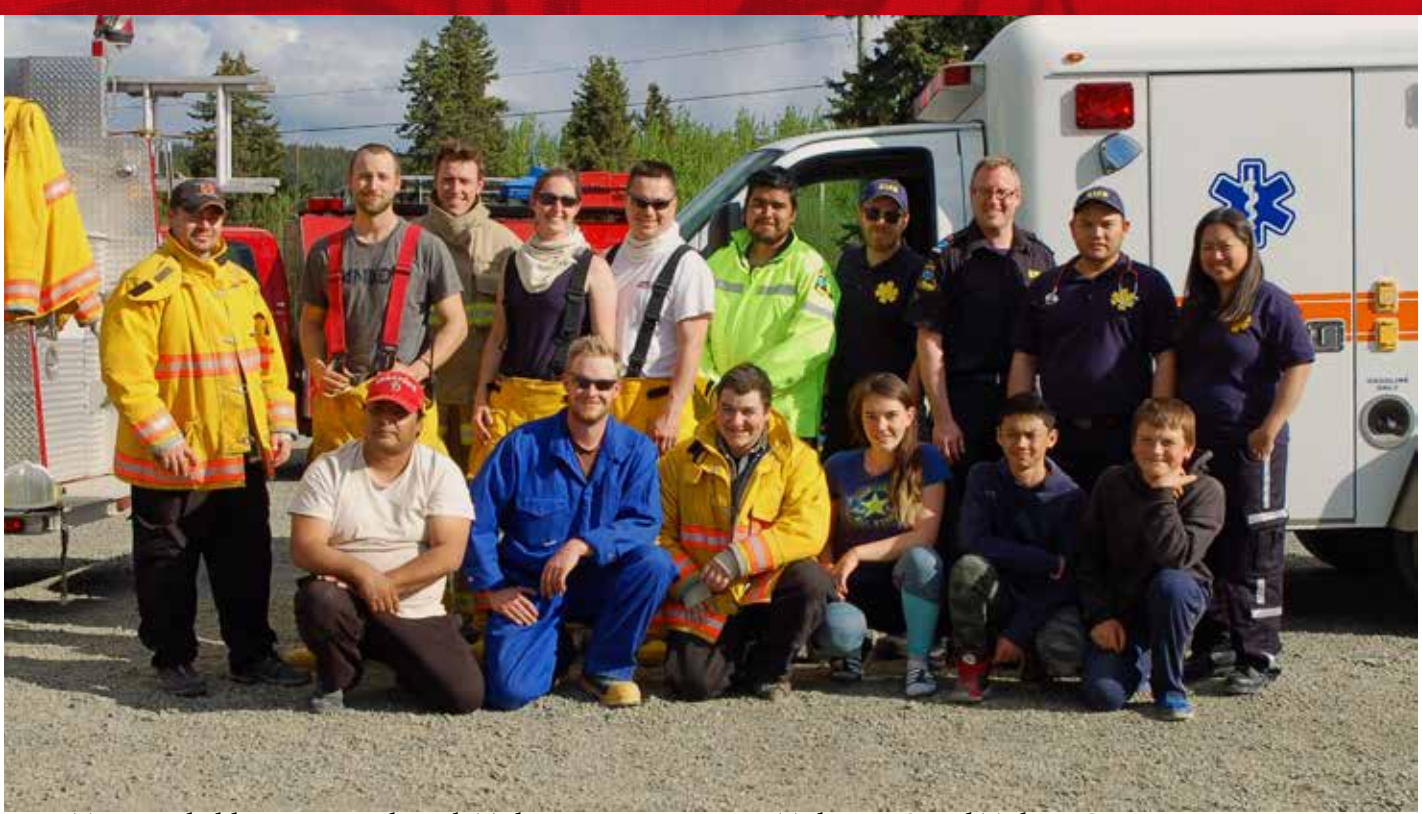
Joint Training held on May 30th with Teslin Fire Department, Teslin EMS and Teslin RCMP We are always looking for new recruits