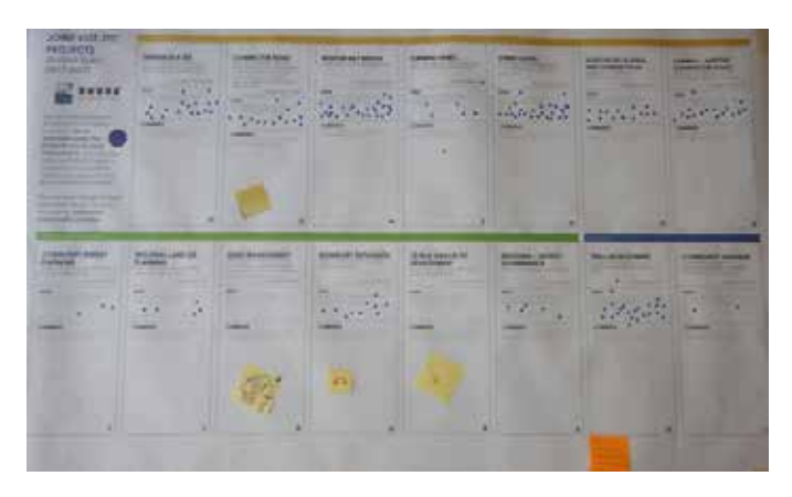
Each participant was given four dots for each project owner. The dots were placed under projects that they thought were of highest priority.